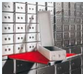
Emerald lockers – pull-out shelf & inner container