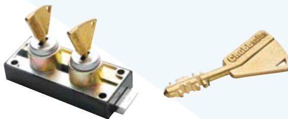
Dual control lock with 2 key locks

All lockers are supplied with a steel inner container. These come standard with a hasp and staple to accept the Renter's own padlock.